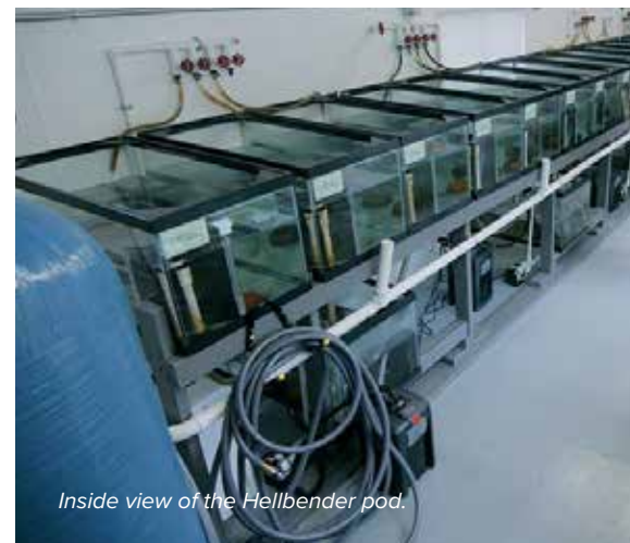
Inside view of the Hellbender pod.