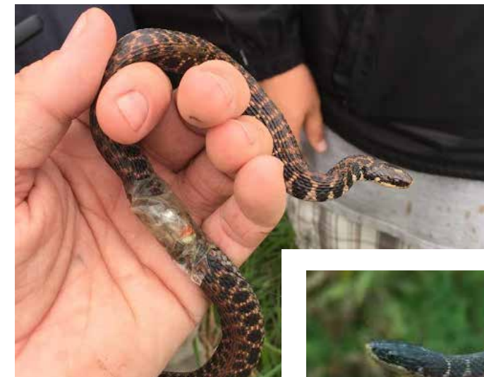
Kirtland's Snake with transmitter.

We continued our partnership with the local teenager who helped us find one of the most productive populations of Kirtland's Snake in this area, that we know of. This site is a new record for the county and a range extension was published in Herpetological Review (see Publications and Grants). To date, we have captured 79 Kirtland's Snakes and 41 marked individuals. While within-year recaptures are common, only one snake has been caught in multiple years. We will continue our surveys at this site to gather more data for population estimates.